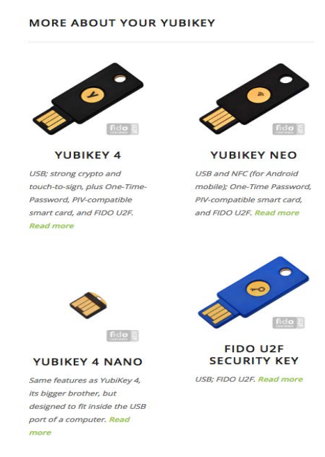
Figure 6. The larger labels and more clarity in labeling offer the promise of improved device identification.

more prominent pictures and descriptors which allows for easier identification of the device to be used. The title clearly shows the purpose, providing confidence to the subject participants that they had found the correct source for device identification. A significant change is the clear identification in the Yubico setup instructions that the button is not a fingerprint reader. The new description is shown in Figure 7. The resulting interaction is extremely clear on this point. At the time of the experiment, participants found it challenging to confirm that a newly registered security key was in fact operating correctly. This confusion was caused by Google's default behavior of marking the browser as a "trusted" device. In this case, participants are not required to use a second authentication factor when logging in, even when 2FA is enabled for the account. The enrollment process did include a confirmation screen with a check-box, which made it possible to refrain from making