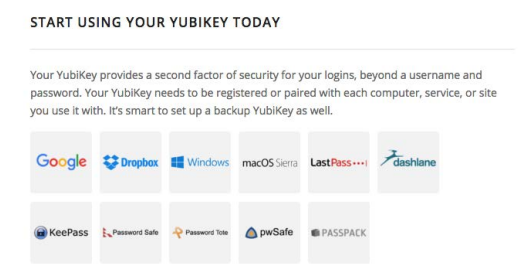
Figure 4. Clear Links to Instructions

The demo does appear to serve the important goal of providing hypothetical demonstrations to prospective institutional customers. However, when this demo is included as part of the display to those who have already purchased the product, it consistently caused confusion. We recommended that this demo should not be accessible to the end participant, as it was a consistent stoppoint. The demonstration cycle has since been removed from being directly in the participant's workflow, though it is still accessible. As a result this hault point went from confounding every single subject in the Yubico condition in Phase-I to having very low impact in Phase-II.